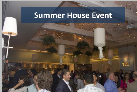
Summer House Event

More than xx,xxx members attended more than 200 ABC events and programs, giving them the leading edge in advancing their business objectives, creating new business opportunities, and gaining insight into emerging trends.