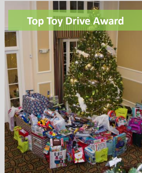
Top Toy Drive Award

The members of ABC of Metro Washington donated hundreds of toys to the Salvation Army Toy Drive at our annual reception. As a result of your generous contributions, the Salvation Army National Capital Area Command awarded our chapter the "Top Toy Drive Award."