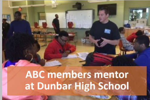
ABC members mentor at Dunbar High School

ABC of Metro Washington partners with Dunbar High School to increase awareness of construction as a career path.