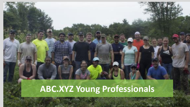
ABC.XYZ Young Professionals

The ABC.XYZ Young Professionals picked 400 pounds of vegetables at Chocolate and Tomatoes Farm for the Manna Food Center.