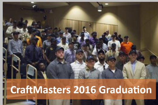
CraftMasters 2016 Graduation

To combat the encroaching workforce shortage, we developed an outreach program for high school students to increase the potential construction candidates for the future. Eighty-six percent of students would consider a career in construction following the presentation.