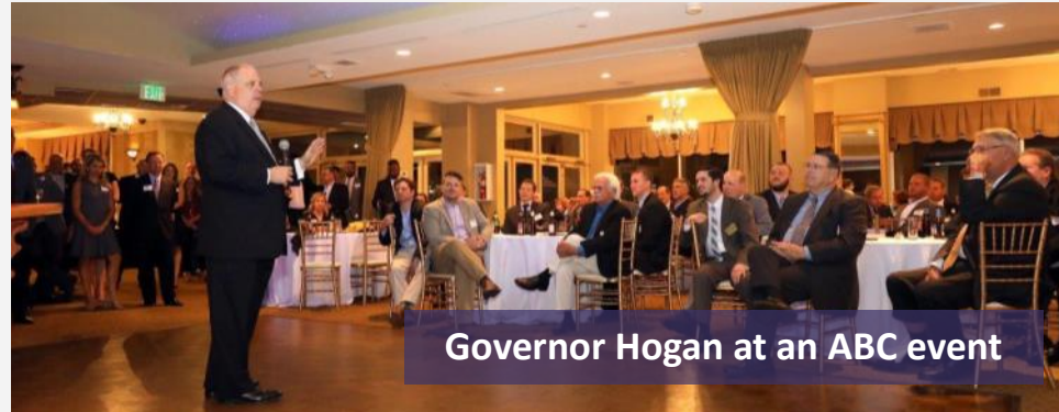
Governor Hogan at an ABC event

Governor Larry Hogan commends ABC and its members for their advocacy efforts on behalf of the merit construction industry. More than $90,000 was raised this year for Governor Hogan's re-election campaign.