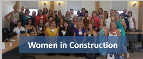
Women in Construction